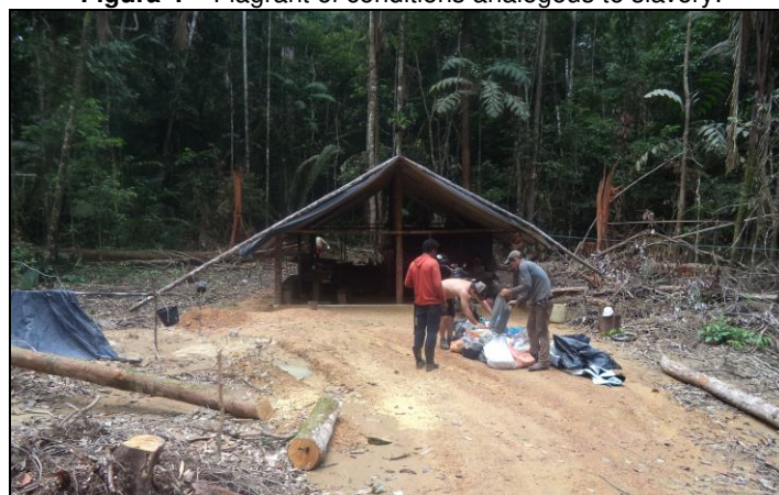
Figura 4 – Flagrant of conditions analogous to slavery.

Slave-like labor is associated with maintaining human beings without access to clean water, providing them with poor-quality food, not paying them wages, forcing them to sleep outdoors, and denying them rights and freedom of movement 10 . Just as in the case observed in the Santo Antônio do Matupi District, Manicoré municipality, in Amazonas, on 11/08/2018, with wood extractors (chainsaw operators), which is quite common, especially in the northern region of the country (Figure 4).