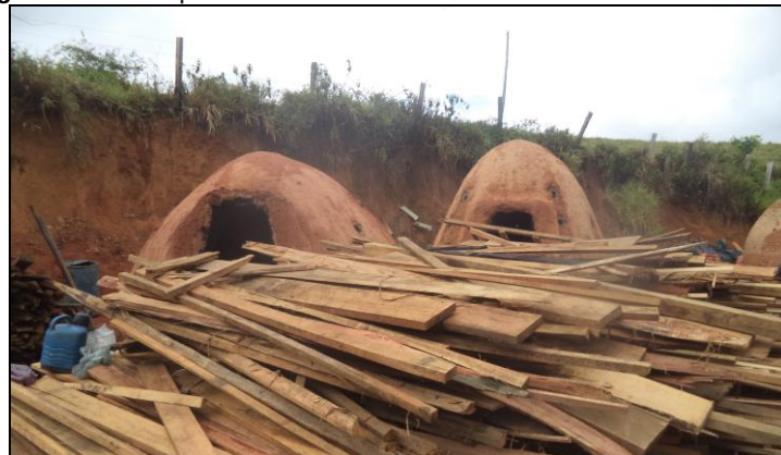
Figure 3 – Wood pieces with minor defects are transformed into charcoal.

In addition to the low utilization of residues from sawmills, a high degree of waste was also observed from these industries. Due to the use of outdated equipment and machinery pieces with minor defects from centuries-old trees are either burned or turned into charcoal (Figure 3).