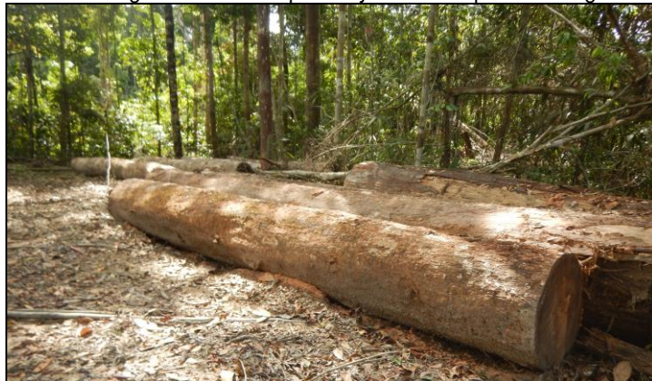
Figure 2 – Clear-cutting of all trees despite only valuable species being commercialized.

Deforestation is inherently destructive, but in Amazonian deforestation, it is unacceptable to cut down all trees so that only the wood from valuable species is commercialized, as occurred, for example, in Apuí, Amazonas, on 08/06/2018 (Figure 2). Deforestation, in this case, aims at land grabbing and the establishment of low-productivity cattle ranching, in order to legitimize the illegal occupation of the area.