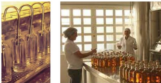
Figure 2 – Typical environment of the still cachaça labeling area (Google)

Once pumped into the tank intended for bottling, the cachaça descends by gravity and passes through at least two polishing filters, with porosities of 5 and 0.5 \mu\text{m} , respectively. Bottling and labeling are conducted manually (Figure 2). Prior to labeling, each bottle is visually observed against an indirect white light source, for clarity and absence of any particles.