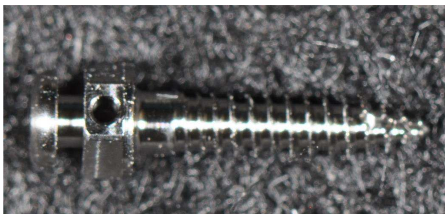
Figure 1. A close-up view of a mini-implant

Despite the different designs, shapes and sizes, which vary according to the commercial brand, it is possible to divide the constitution of MI into three distinct parts: A) head, B) transmucosal profile and C) active tip (Fig. 1).